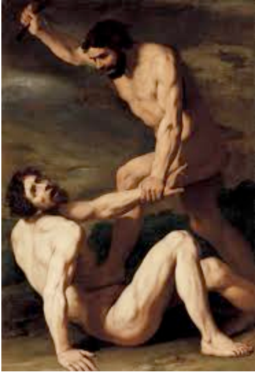
CAIN & ABEL